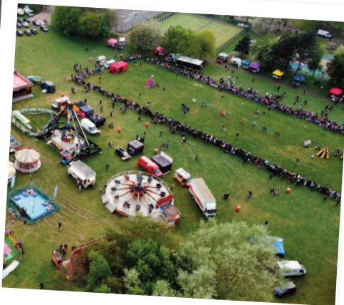
St George's Day jousting - Main Arena