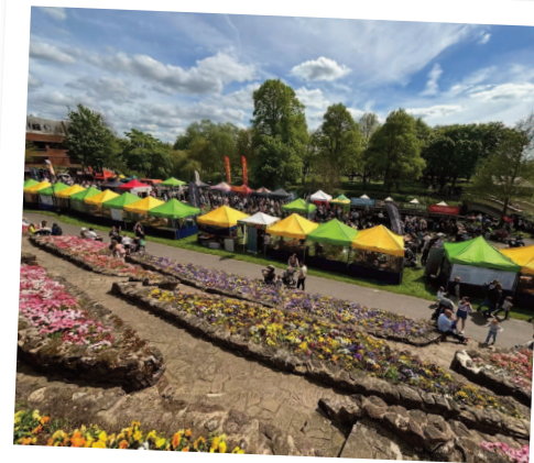
Food Festival - lower Lawn