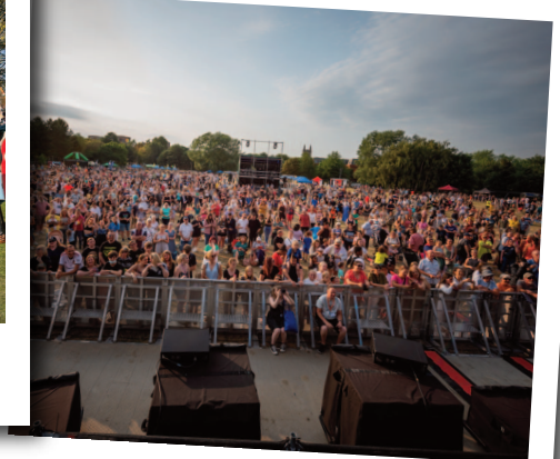
View from the stage - Main Arena