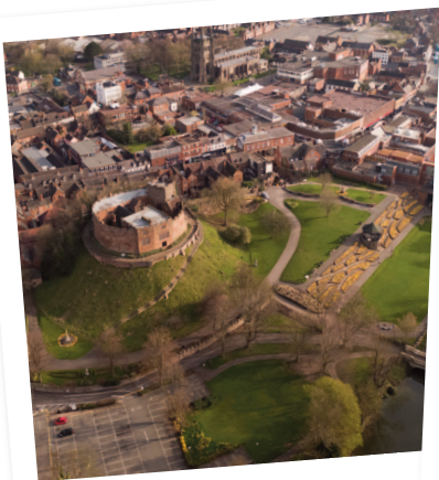
View of Holloway and lawns