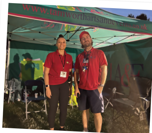
Some of our team on site at an event.