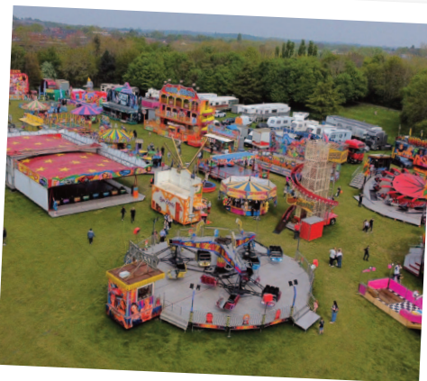
Barker's Fun Fair - Main Arena