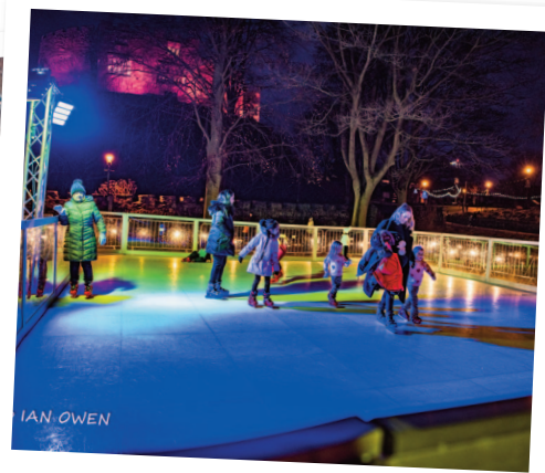
Ice rink - Holloway Lawn