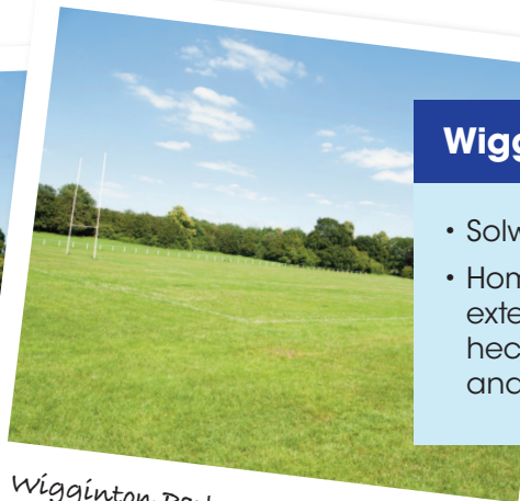
Wigginton Park, rugby pitch