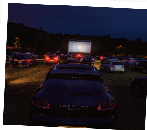
Drive In Cinema - Main Arena