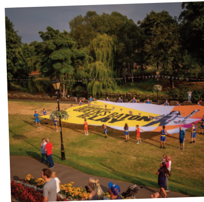
Queen's Baton Relay - Lower Lawn

Whether you're planning a vibrant food festival, an engaging community fair, or a memorable music event, Tamworth Castle Grounds provides the perfect canvas for your creative vision. The historic castle, beautiful landscapes, and modern facilities combine to create an event space unlike any other.