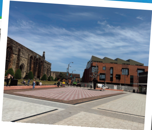
St Editha's Square