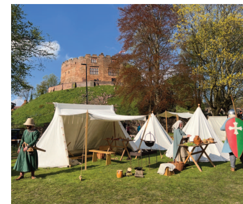
Saxon encampment - Holloway Lawn