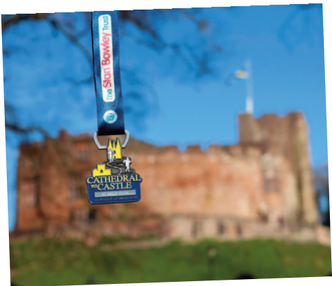
Cathedral to Castle Run

“I just want to take the opportunity to thank you for the excellent service you provide. We recently hired grounds from Tamworth Arts & Events for our event, and we couldn't be happier with the experience. The team was incredibly friendly, professional, and easy to work with, making the entire process smooth and stress-free. The hire process itself was clear and straightforward, with all the necessary information readily available.