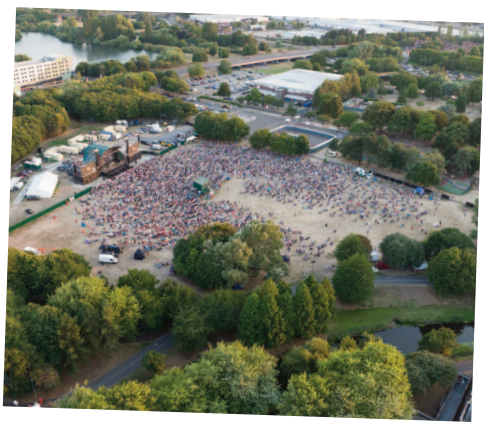
Music Concert - Main Arena