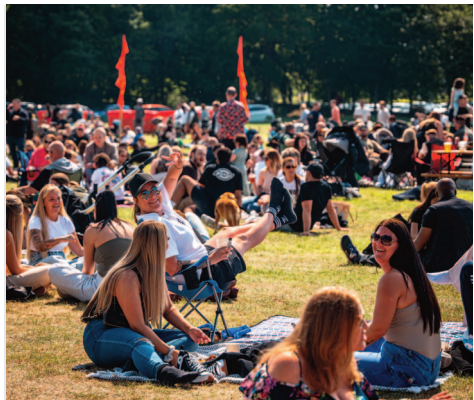
Digbeth Dining Club - Main Arena