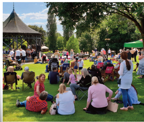
Bandstand concert - Upper Lawn