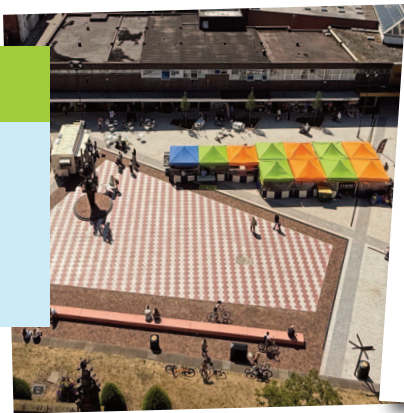
St Editha's Square